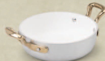
Eterna two-handle little omelette pan Ø cm 10/12/14/16 • ALSA110W10 • • ALSA110W12 • • ALSA110W14 • • ALSA110W16 •