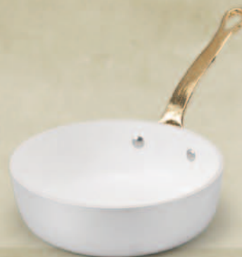
Eterna little pan Ø cm 10/12/14/16 • ALSA111W10 • • ALSA111W12 • • ALSA111W14 • • ALSA111W16 •