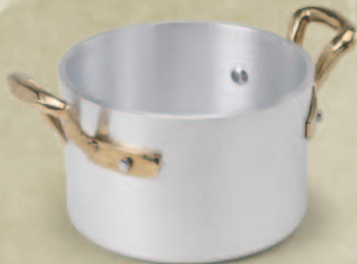
Due-handle high little saucepot Ø cm 10 • ALMA10410 •