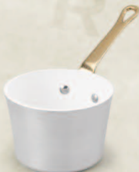
Eterna one-handle conical little saucepan Ø cm 8 • ALSA109W08 •