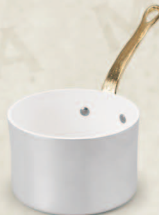
Eterna one-handle high little saucepan Ø cm 10 • ALSA105W10 •