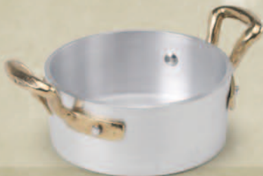
Two-handle low little casserole pot Ø cm 10 • ALMA10610 •