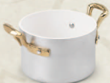
Eterna two-handle high little saucepot Ø cm 10 • ALSA104W10 •