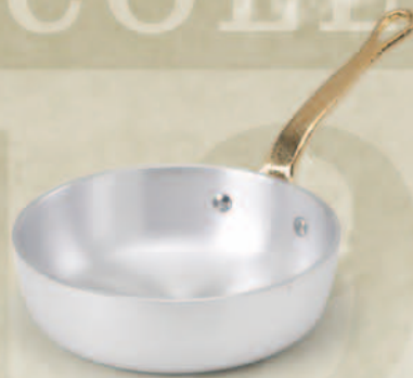
Little pan Ø cm 10/12/14/16 • ALMA111110 • • ALMA111112 • • ALMA111114 • • ALMA111116 •