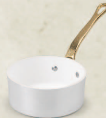
Eterna one-handle low little casserole pan Ø cm 10 • ALSA107W10 •