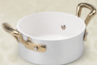
Eterna two-handle low little casserole pot Ø cm 10 • ALSA106W10 •