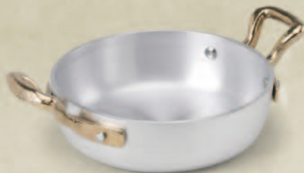
Two-handle little omelette pan, Ø cm 10/12/14/16 • ALMA111010 • • ALMA111012 • • ALMA111014 • • ALMA111016 •